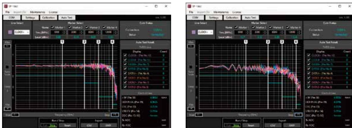
When measuring the master cable

You can check the frequency characteristics, TMD5 line, and control lines on one screen.